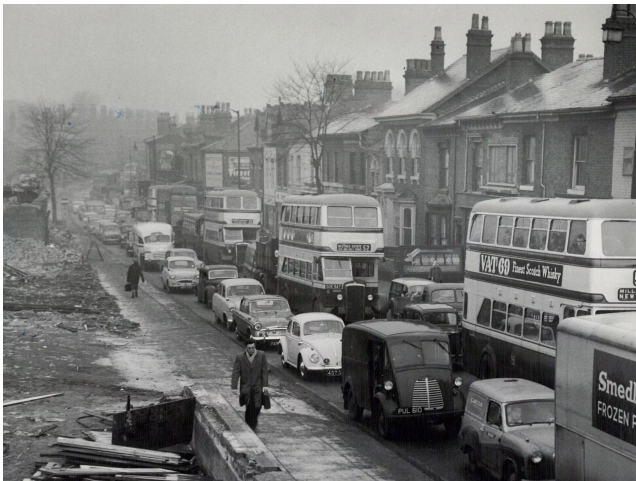
Aston Street in Birmingham, England, 1962